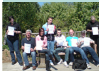
Eight successful Rural Skills Academy students proudly showing off their 'Certificates of Completion'