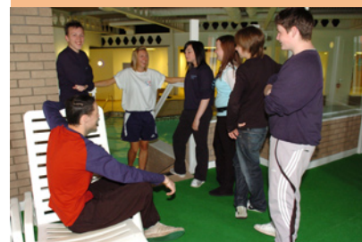
Craigroyston pupils at the Edinburgh Capital Hotel © Iain Sharp